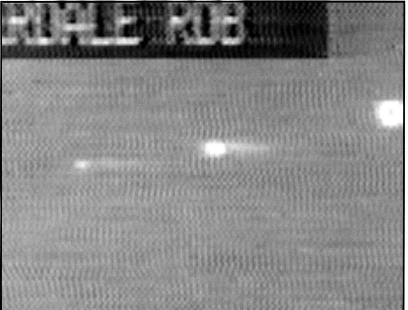
Enlargement of picture at time 21:15:04